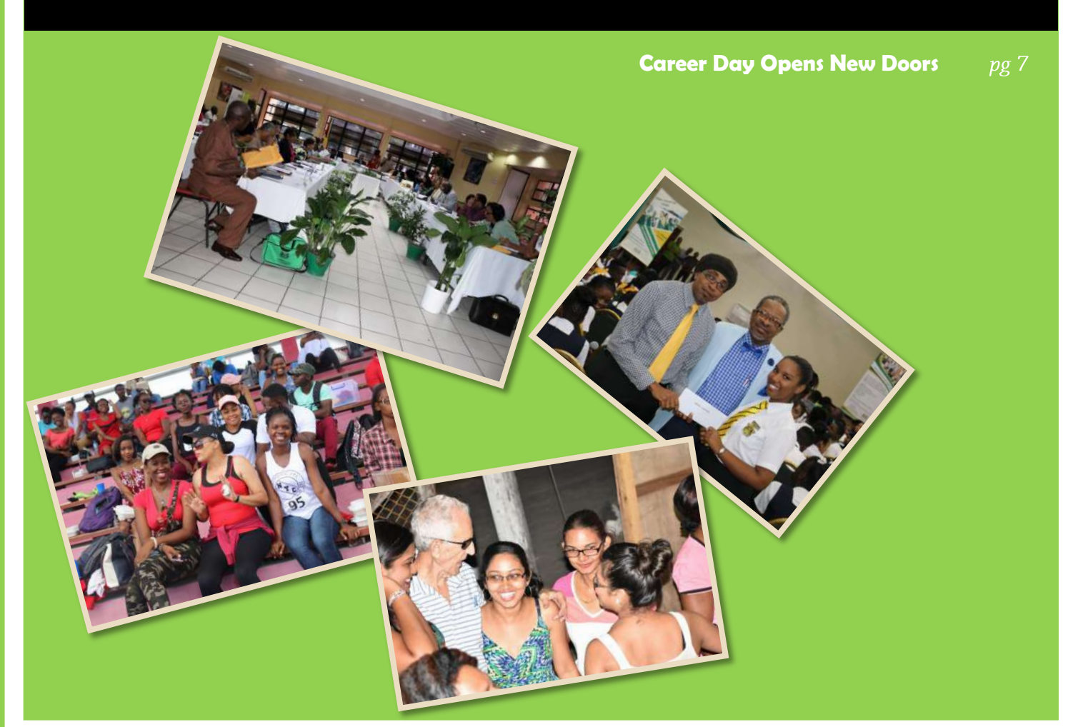
"The roots of education are bitter, but the fruit is sweet" -- Aristotle

Conversations on Law & Society pg 18 First Meeting of UG Press Board pg 19 & 20