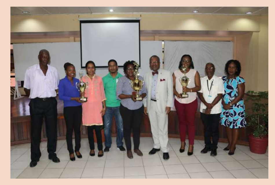
Right: The Vice-Chancellor and the first, second and third place winners

Although the judges noted that the competition was close, they selected three winners and presented trophies to the first-prize winner, the Faculty of Agriculture and Forestry; second-place winner, the Faculty of Earth and Environmental Sciences; and the Registry, which came in third place. All other participants of the Open/Career Day activities, both internal and external, were given certificates of appreciation for their participation.