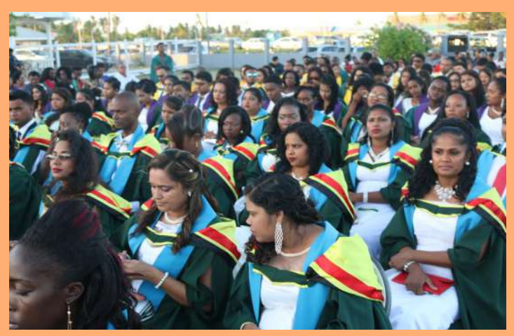
A section of the graduating class of Berbice Campus 2017

Graduates, for many of us graduation is actually quite awkward. It's a moment when we are torn between the joy of our memories and the excitement of our future. Should we look back on what could be noted as part of the best years of our lives? Times filled with joy, parading up and down the corridors looking for a class that we had already passed a thousand times. No, really, it was quite joyful – that moment when we realized that we didn't need a gym membership because those stairs were made to keep us fit. Or those moments when we passed by the canteen and the smell of curry knocked our senses for a boundary. And that egg ball... a superb start for the vigorous tutorials with our lecturers. Really, it was like playing basketball: hoping to all the Gods that when